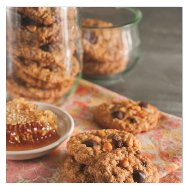
YIELD: Makes 24 cookies